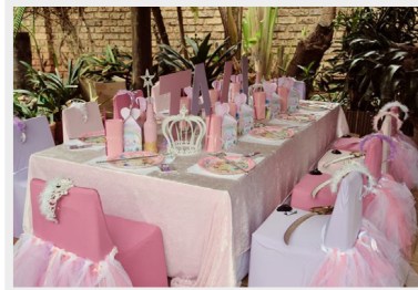
* THEME IDEAS ABOVE