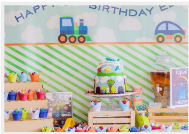
* THEME IDEAS ABOVE